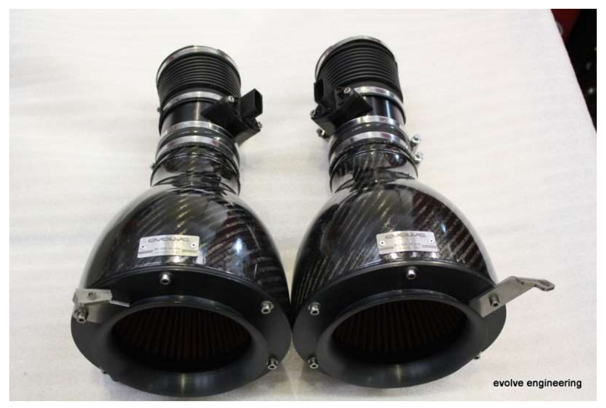
Bank 1 Intake