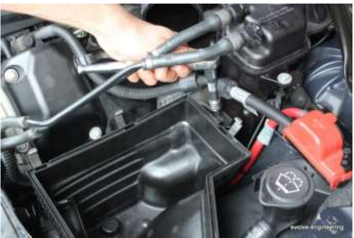
Rear 10mm nut on both banks