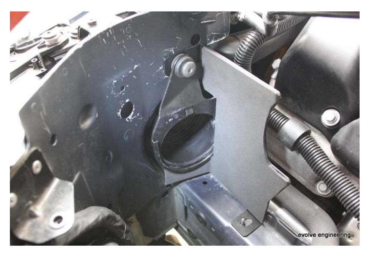
iv. Secure with OEM torx through the air feed and supplied plastic nut or existing rubber bush onto chassis

iii. Install heat deflectors behind air feed and align holes making sure you locate lower bracket onto chassis thread: