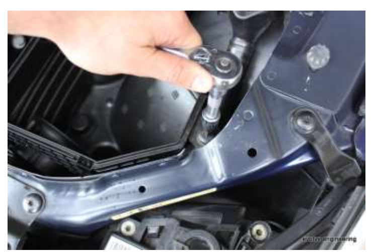
Torx bolt on Bank 2