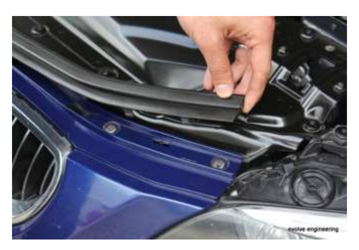
5.2 Unclip Plastic strip