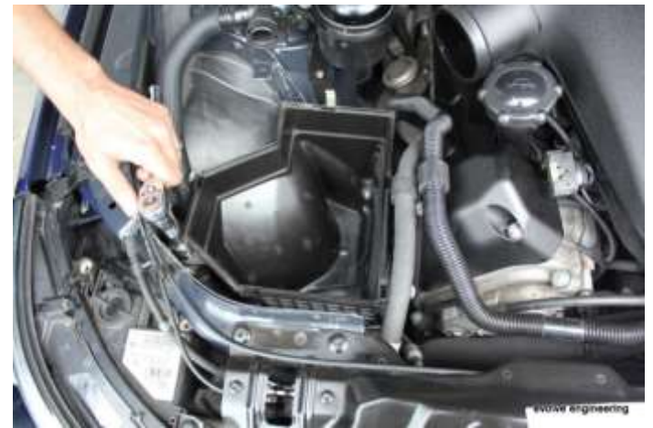
Bank 1 10mm Nut removal