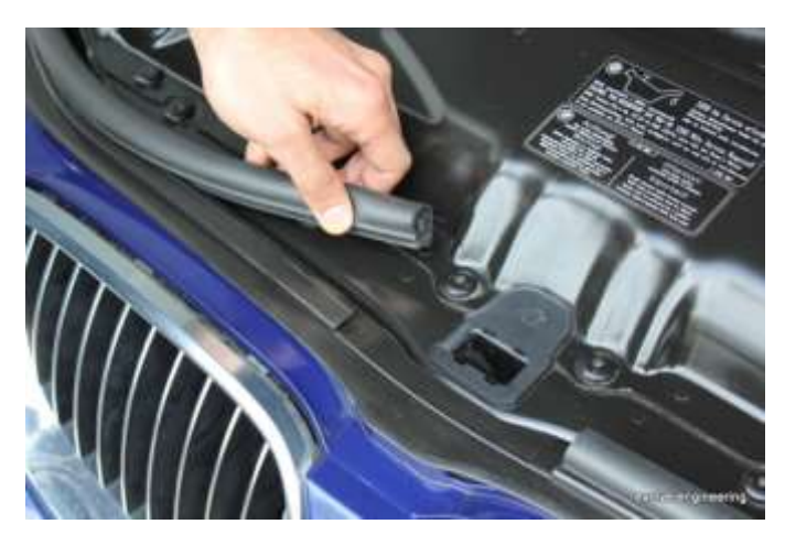
5.1 Pull back rubber seals

6. Remove plastic strip from top of front bumper: