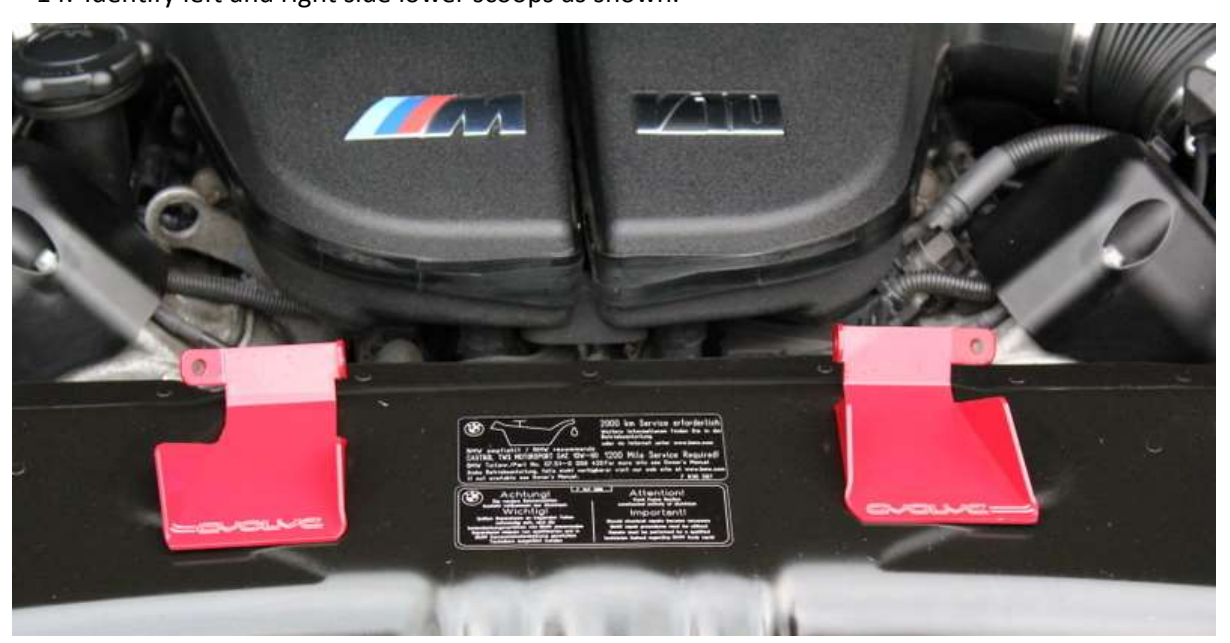
Left Hand Side Scoop